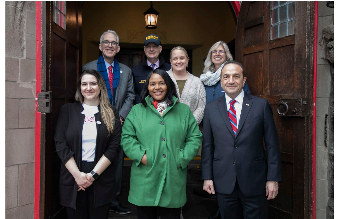
Project Homeless Connect, Jan. 31, 2025

Increased headcount in the Office on Aging by one to administer more Jersey Assistance for Community Caregiving clients.