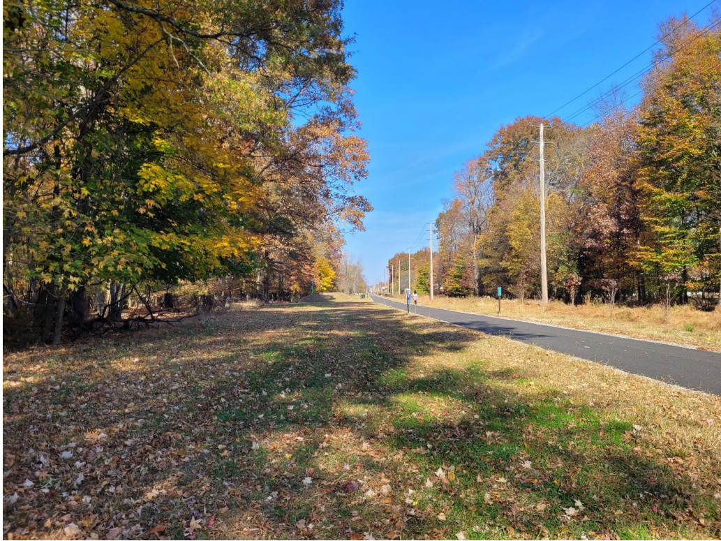
Pompton Valley Rail Trail in Pequannock and Wayne