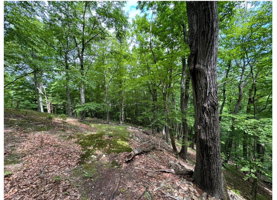
Schiff Preserve Addition, Civile Property, Mendham Twp - 2024 approved Open Space grant