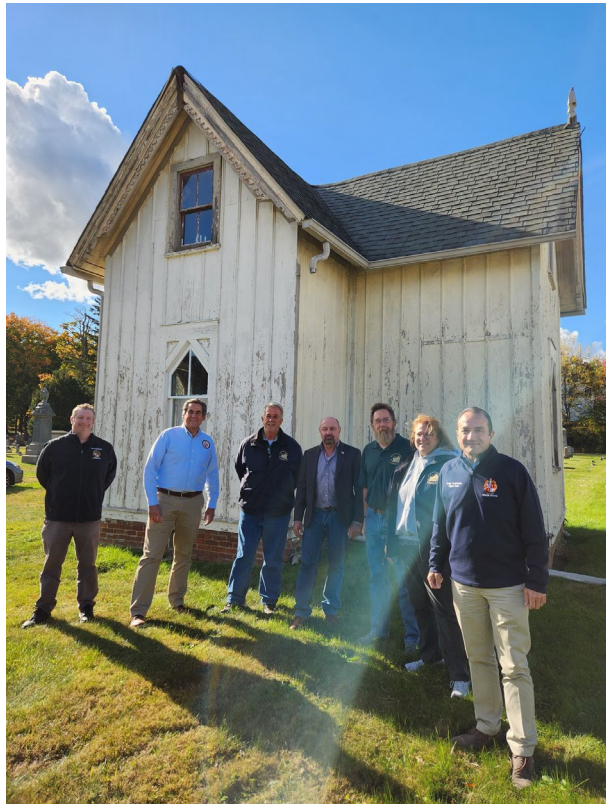
Orchard Street Cemetery Gatehouse, Dover – 2024 approved Historic Preservation grant

The Preservation Trust Fund Tax will stay level for 2025, at 5/8 cent per $100 of total county equalized property valuation. It has financed county park improvements, preservation programs and restoration projects through these popular grant programs: