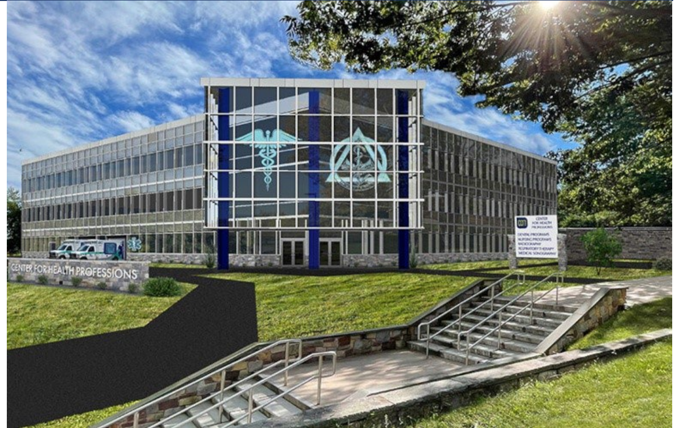
Concept design of the planned CCM Center for Health Professions Building