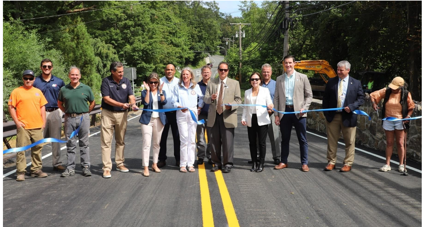
Millbrook Avenue Bridge Dedication, Randolph, Aug. 2023