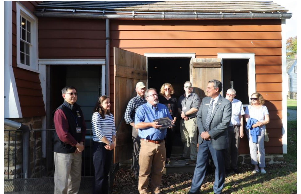
Historic Speedwell Wheelhouse Dedication, Oct. 2023