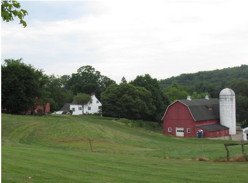
Parks Farm, Chester Township

The Preservation Trust Fund Tax will stay level for 2024, at 5/8 cent per $100 of total county equalized property valuation. It has financed county park improvements, preservation programs and restoration projects through these popular grant programs: