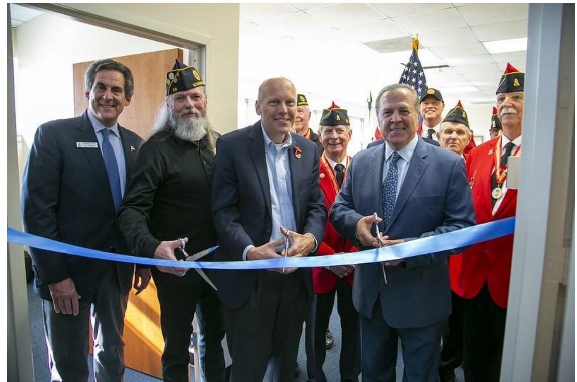
Commissioners dedicate expanded Veterans Services Office, Nov. 2023